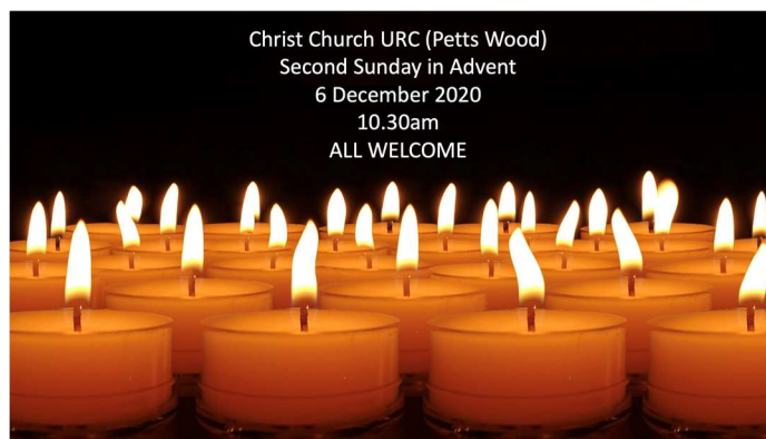
Christ Church URC (Petts Wood) Second Sunday in Advent 6 December 2020 10.30am ALL WELCOME

This Sunday we shall be meeting to worship in the church. Those unable to attend in person can watch on YouTube or join in by 'phone