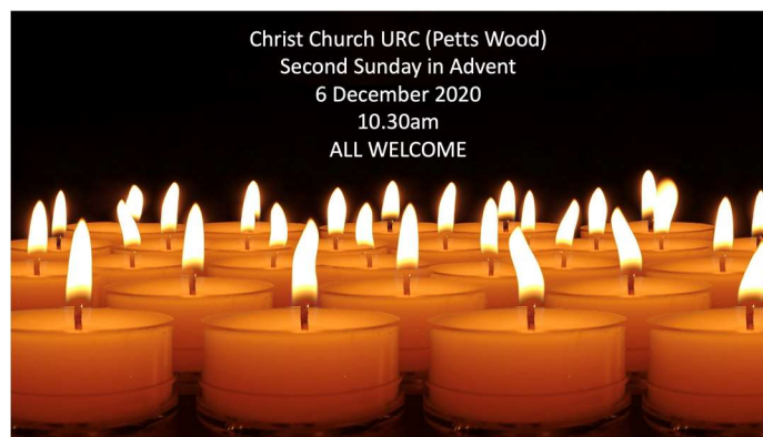
Christ Church URC (Petts Wood) Second Sunday in Advent 6 December 2020 10.30am ALL WELCOME

This Sunday we shall be meeting to worship in the church. Those unable to attend in person can watch on YouTube or join in by 'phone